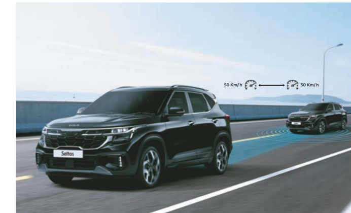
Smart Cruise Control with Stop and Go

The new Seltos helps you manoeuvre with badass confidence on the road with the help of an advanced automated technology - the Advanced Driver Assistance System (ADAS) encompassing 17 Autonomous Level 2 features. It uses camera and radars to detect any obstacle on your path or driver error and in turn, alerts the driver and activates possible safeguards in the car by automating driving controls. Thereby ensuring that you have a safer, more intuitive and rewarding driving experience.