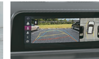
360° Camera with Blind View Monitor in Cluster