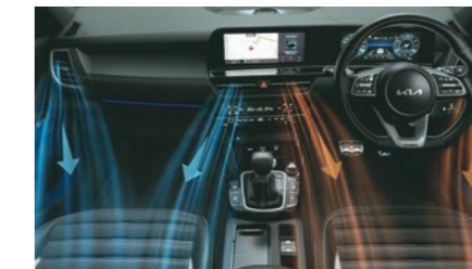
Remote AC Control