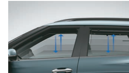
Voice Controlled Window Function