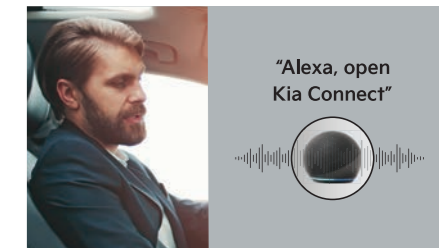
Kia Connect Skill with Amazon Alexa