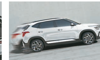
Electronic Stability Control (ESC), Hill Assist Control (HAC) & Vehicle Stability Management (VSM)