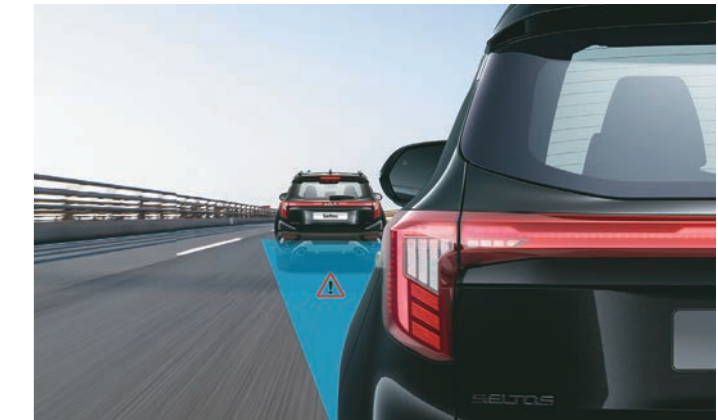
Front Collision Warning and Avoidance Assist (FCW and FCA)