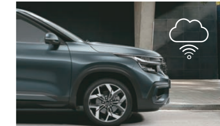
OTA Map & System Update