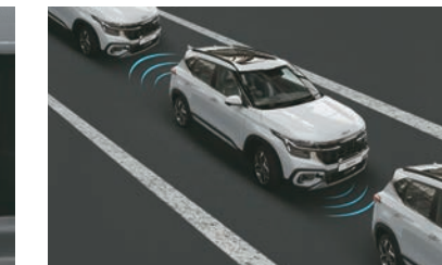
Attentive Front and Rear Parking Sensors