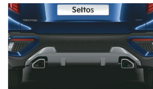
Stylish Dual Sport Exhaust (G1.5T Only)