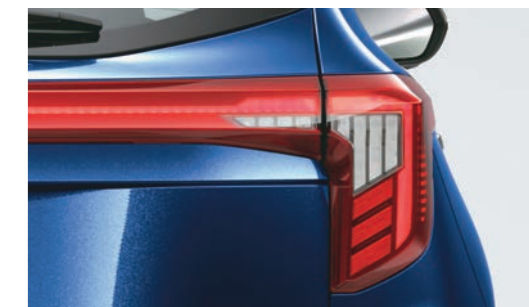
Distinctive Star Map LED Connected Tail Lamps