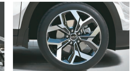
All Wheel Disc Brakes