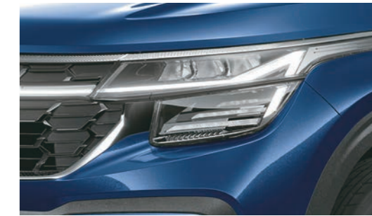
Dazzling Crown Jewel LED Headlamps with Star Map LED DRLs & Star Map Sweeping LED Light Guide

A bold new design with more style and attitude. The exterior design of the new Seltos highlights its bold traits. Its aggressive design language and a muscular built is further accentuated by athletic shoulder lines and a more stylized front and rear to emphasize its robust character. The reinvented Seltos is here to take on every road.