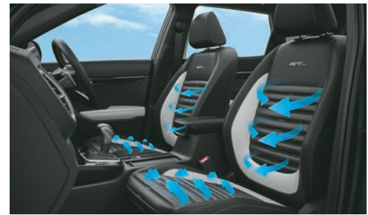
Comfortable Front Ventilated Seats with 8-way Power Driver's Seat

There's no better way to travel than in the new Seltos. The awe-inspiring new interiors are reimagined to look aesthetically stylish and edgy with generous space that offer you a supremely comfortable drive. With a whole new range of state-of-the-art features like the Electric Parking Brake, Smart Pure Air Purifier with virus and bacteria protection and Bose Premium Sound System with 8 Speakers, the new Seltos takes your driving comfort to the next level.