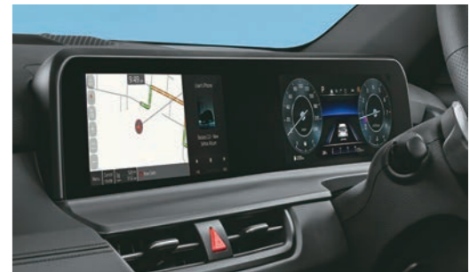
Intuitive 26.03 cm (10.25") HD Touchscreen Navigation + Full Digital Cluster with 26.04 cm (10.25") Color LCD MID