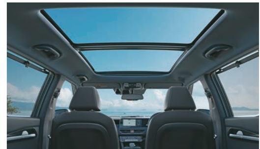
Awe-inspiring Dual Pane Panoramic Sunroof