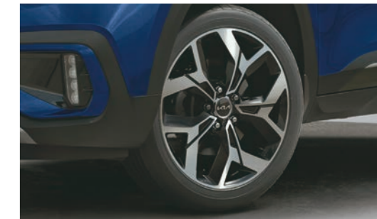
Striking R18 (46.20 cm) Crystal Cut Glossy Black Alloy Wheels