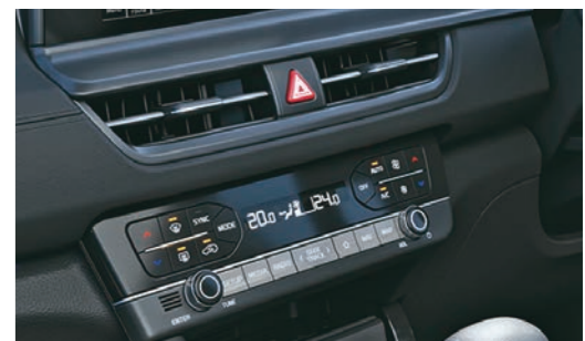
Intelligent Dual Zone Fully Automatic Air Conditioner