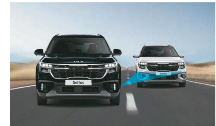
Blind Spot Collision Warning (BCW)